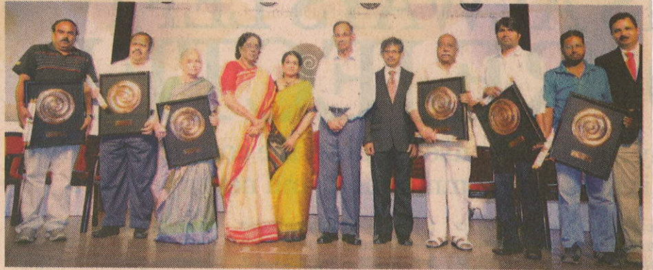
Awardees at the first edition of the Champions of Chennai Awards by the KSA Trust in the city on Saturday